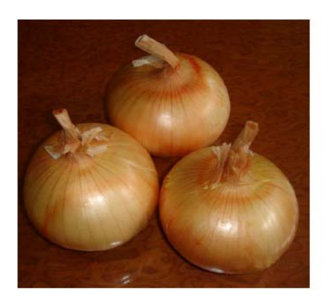
Figure A1 Onion bulb with complete skin and dry neck