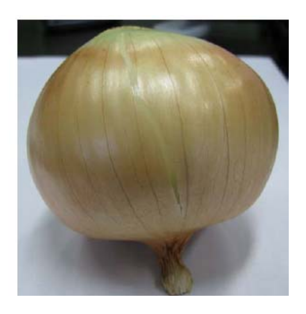
Figure A2 Slightly crack of the skin