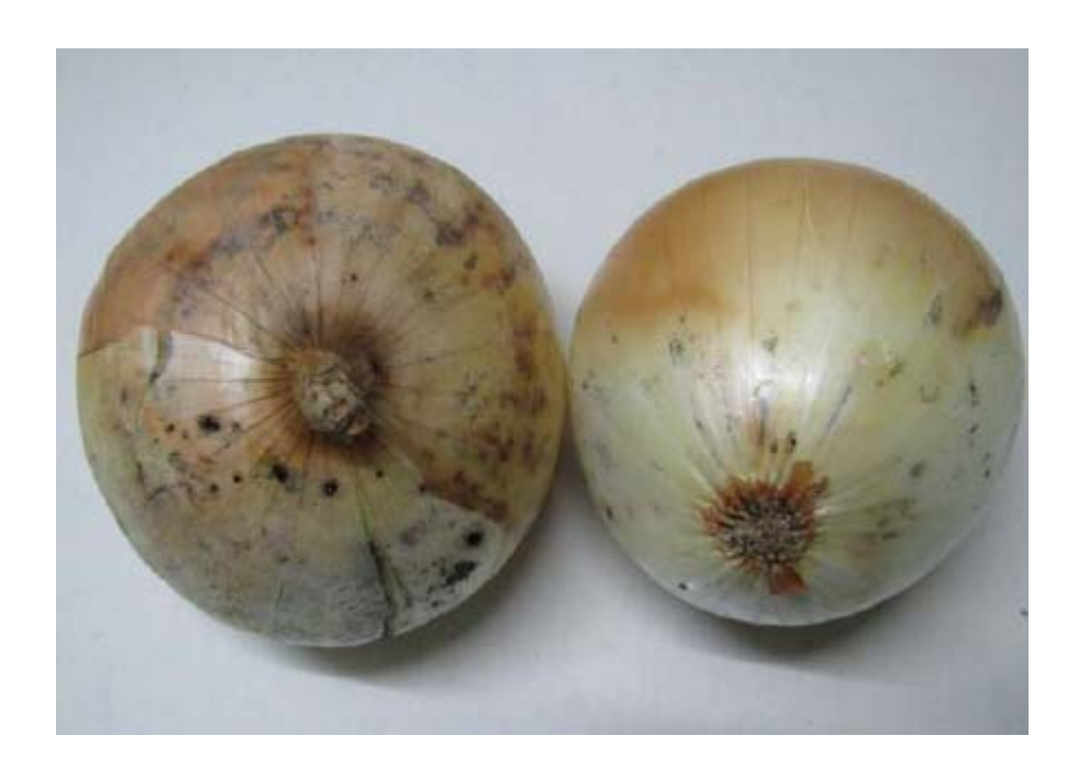
Figure A5 External damages caused by mold