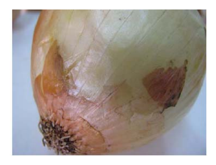
Figure A7 External rotting