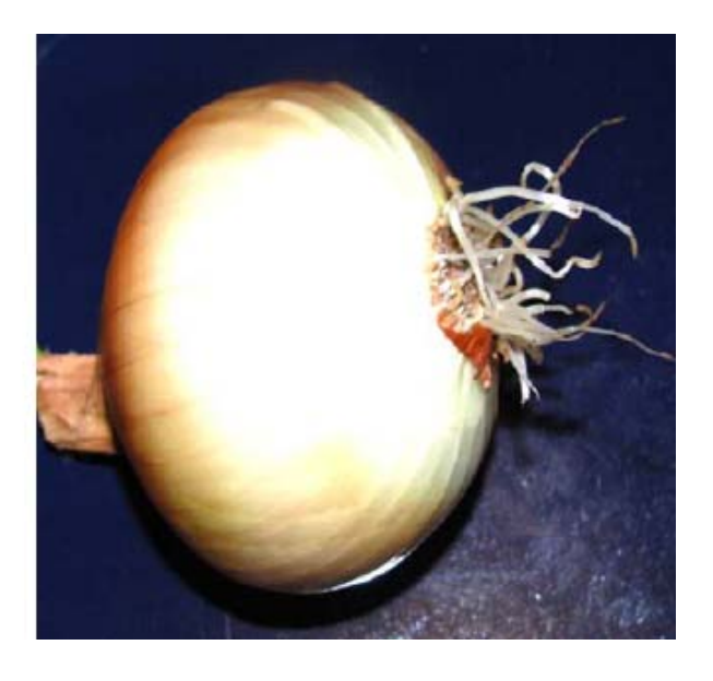
Figure A4 Rooting