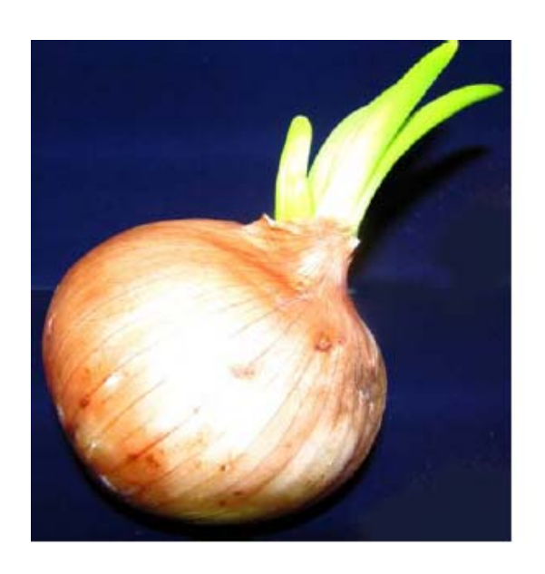
Figure A3 Late sprouting